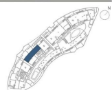
CUADRO DE SUPERFICIES