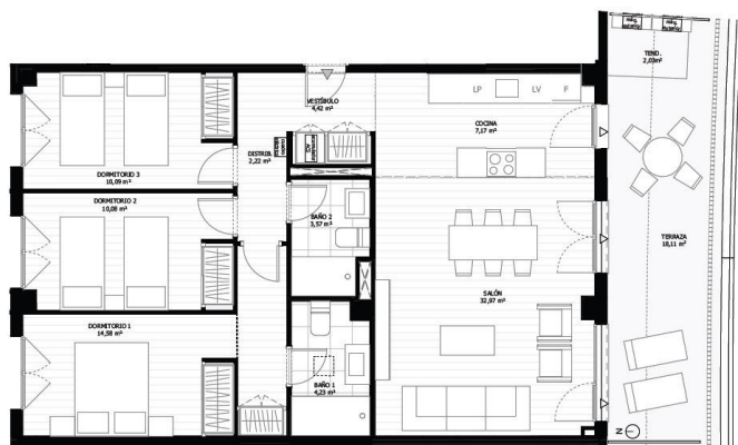
VT0072 3 dormitorios Planta 1-Portal 9-Letra B

Este documento es propiedad de S-HOMES, S.L. y no debe ser reproducido, distribuido o publicado sin el consentimiento escrito de S-HOMES, S.L. S-HOMES, S.L. se reserva todos los derechos de propiedad intelectual y industrial. Toda reproducción o uso no autorizado de este documento será sancionado. S-HOMES, S.L. no se responsabiliza de los errores de impresión o de los cambios de precios sin previo aviso.