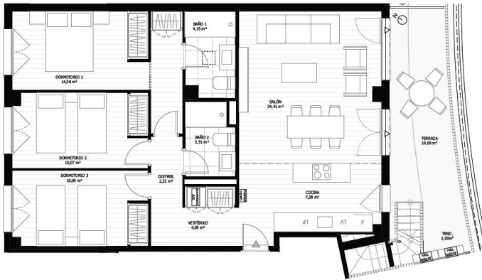
VT0055 3 dormitorios Planta 1-Portal 6-Letra A

*Este documento es un modelo de información orientativa. No debe ser considerado un contrato de compraventa. El precio, las características y las condiciones de venta de este inmueble, así como el precio de venta, están sujetos a modificaciones sin previo aviso. El precio de venta de este inmueble, así como el precio de venta, están sujetos a modificaciones sin previo aviso. El precio de venta de este inmueble, así como el precio de venta, están sujetos a modificaciones sin previo aviso.