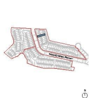
TIPO A3 4 DORMITORIOS