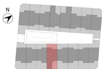
VIVIENDA P. PRIMERA 2 DORMITORIOS