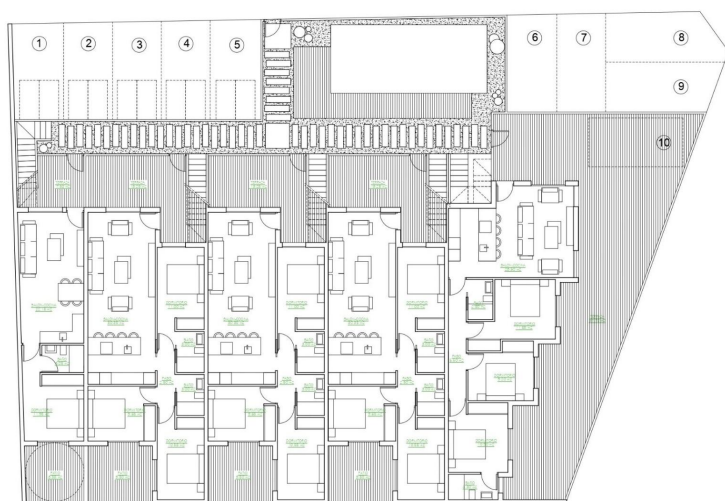
Planta Baja Conjunto