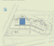
PLAN DE LAZARILLO GENERAL